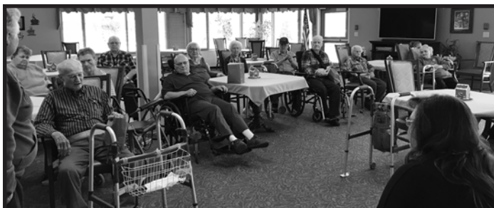
Large groups of veterans gather at Fremont area care centers to be part of the 200 Christmas bags given away each year to our heroes. Fremont unit works with the DAV chapter to thank our veterans for their service and wishing them happy holidays.

estimated that each bag had about $60 worth of goods in it.