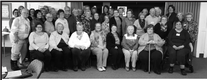
FAARSP members took a group picture to celebrate the good news that they had donated over $9,000.00 to Community a Health Charities of NE for their 2018 campaign.

Food. Fun. Fellowship. HARSP had them all when we held our annual membership dinner meeting in July. As usual, the meeting was well attended. Thirteen newly-retired area teachers were invited as our guests, and all thirteen became new members. Also