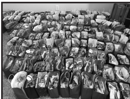
Some of the hundreds of Christmas bags packed and given out to the veterans in Fremont area care facilities and VA homes in Nebraska.