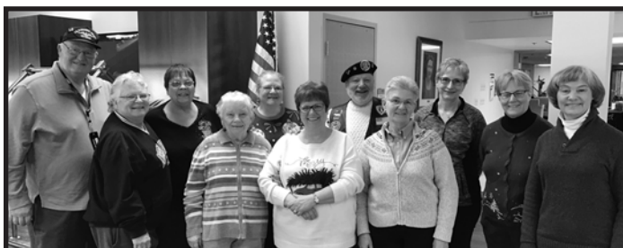
Fremont unit members gather with Disabled American Veteran representatives for a picture after spending time listening to and talking to the veterans in a Fremont area care facility during their Christmas bag delivery.