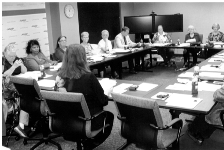
NARSP Board of Directors' Annual Meeting held on Tuesday, September 25, 2018 in Lincoln at the AARP Nebraska Offices.