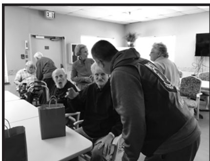
The Fremont unit and members of the Fremont DAV move around the room thanking the vets for their service and wishing them happy holidays.

estimated that each bag had about $60 worth of goods in it.