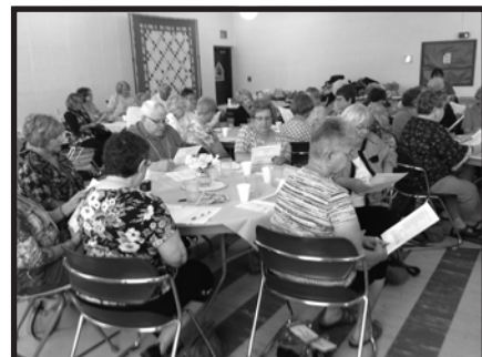
Members of Fremont Area Association of Retired School Personnel participate in their memorial service which recognized the three members lost this last year.