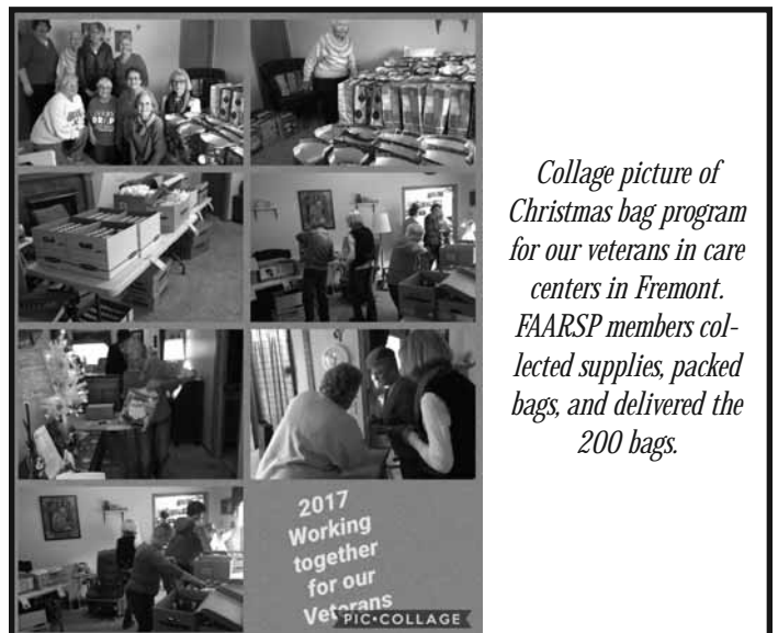
Collage picture of Christmas bag program for our veterans in care centers in Fremont. FAARSP members collected supplies, packed bags, and delivered the 200 bags.