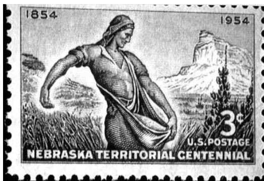
Two of many Nebraska related stamps

Excellent place for the convention - Great food - Wonderful time to visit with other members!