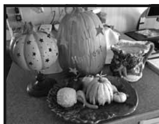
Items donated by FAARSP to the Bridge (domestic abuse) for auction to raise funds for the organization during the holiday season.

from Community Health Charities was there to thank us for 5 years of continued service to her group. The first year 8 members gave $395. In 2017, 53 members donated $7,125.