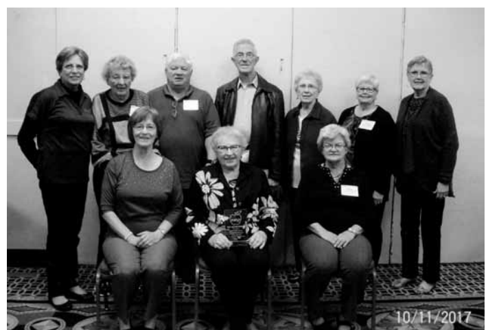
"Hip, Hip, Hooray!" to the Hastings Unit for having the most convention attendees!