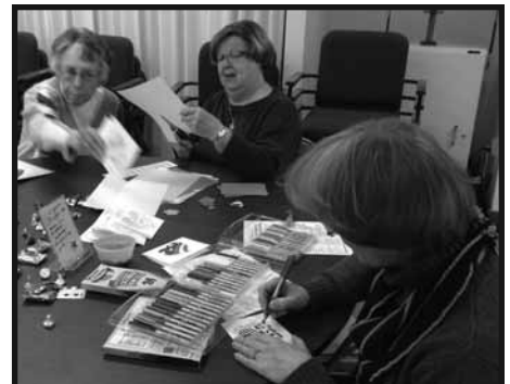
During the January meeting FAARSP members spent their time making over 400 valentines to go with bags of candy packed for our Veterans in state veterans homes and VA hospitals in Nebraska.