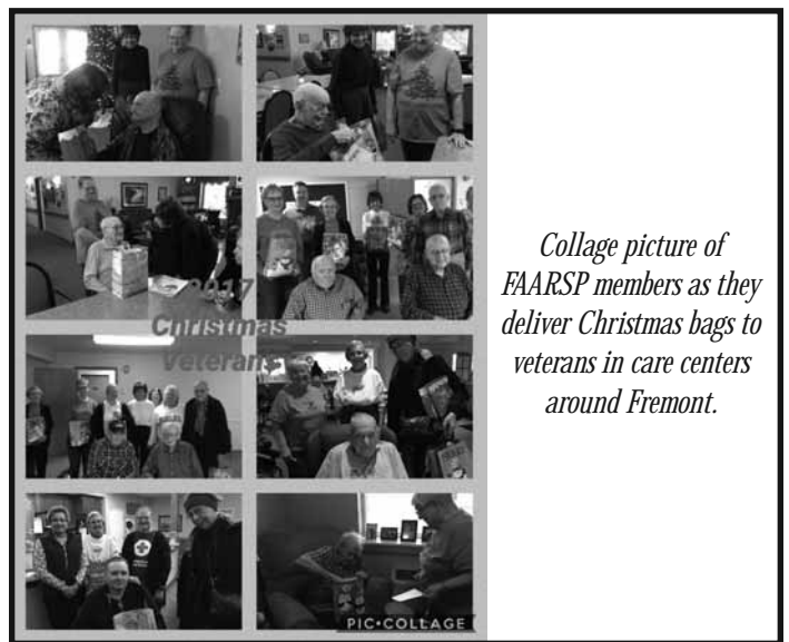
Collage picture of FAARSP members as they deliver Christmas bags to veterans in care centers around Fremont.