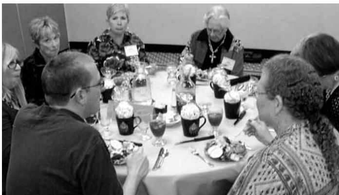
Luncheon, conversation, and fellowship.