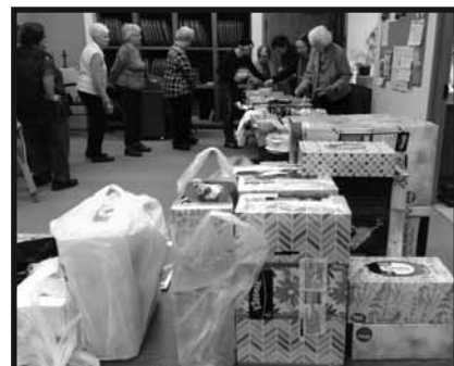
Each meeting members of FAARSP donate piles of designated items for the Low Income Ministry for distribution for the needy.

Six big boxes of school supplies were collected and delivered to the Low Income Ministry. Our day of service project involved giving snacks to area Boy Scout leaders and