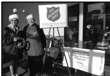
As a service project FAARSP members rang bells for the Salvation Army in November.

It was announced that we have 105 paid members this year. 43 pounds of facial tissue were