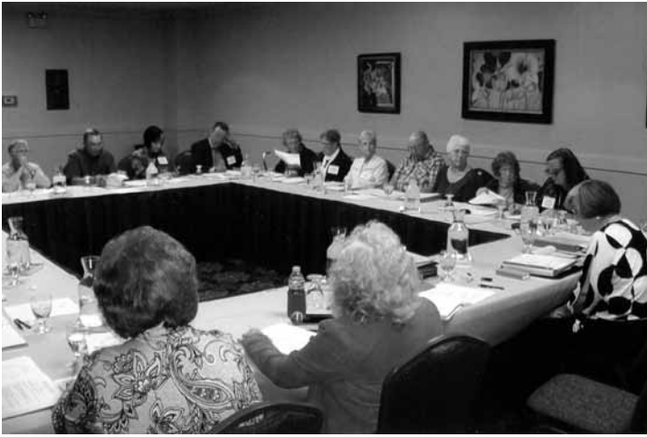
Board of Directors' Meeting

Both (programs) historically interesting - Beautiful Nebraska History