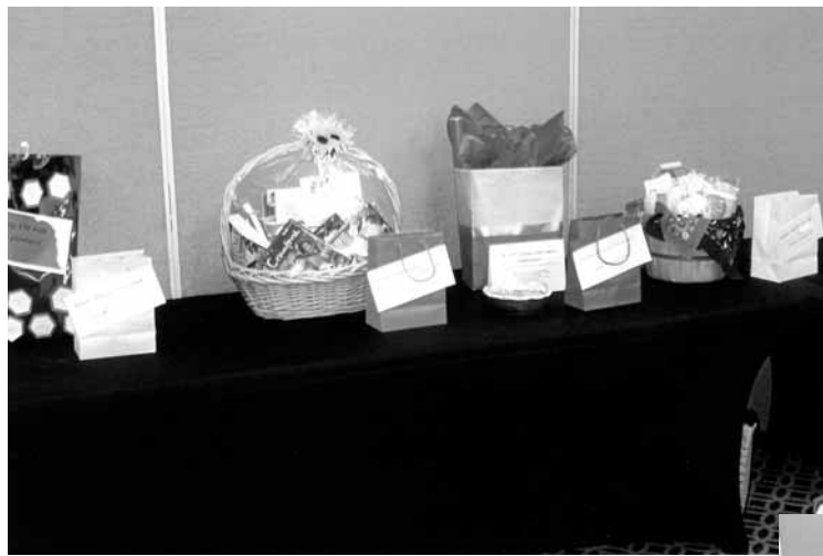
Sampling of the ten Theme Baskets raffled at the end of the convention.

Enjoyed all of it. Thanks to all the officers and directors!