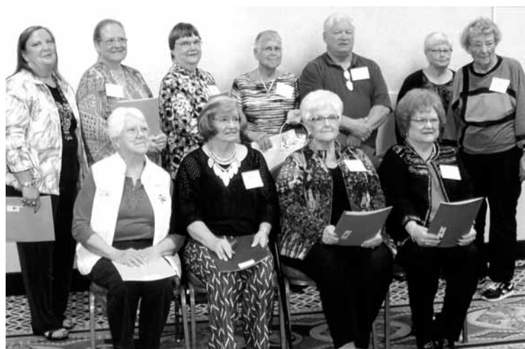
Unit representatives receiving certificates for Community Service Hours, Days of Service activities, and Mission Statement recognition.