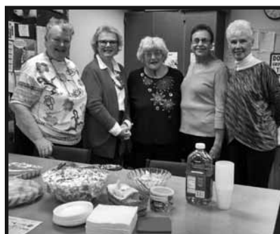
FAARSP members signed up to deliver treats to local schools as a thank you for what they do for our children in the area.

thanking them for their service. Also FAARSP members served brunch to Habitat workers throughout the building season. A memorial service was held for the two members that had died this year.