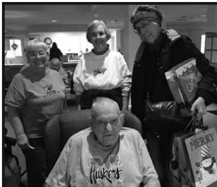
FAARSP members listen to stories from veterans as they deliver their Christmas bags.

Membership books were distributed for the 2017-2018 year. Bell ringers for Salvation Army were organized and a date was selected to do this. The group collected enough money to sponsor 7 families for the Salvation Army